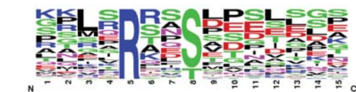
The motif logo shows the amino acid distributions around the sites recognized by the Immunoaffinity beads from PTMScan® Phospho-AMPK Substrate Motif (LXRXXS*/T*) Kit #5564 .