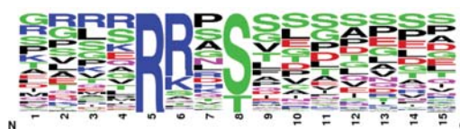
The motif logo shows the amino acid distributions around the sites recognized by Immunoaffinity beads from PTMScan® Phospho-PKA Substrate Motif (K/RK/RXS*/T*) Kit #5565 .

Applications: W—Western IP—Immunoprecipitation IHC—Immunohistochemistry ChIP—Chromatin Immunoprecipitation IF—Immunofluorescence F—Flow cytometry E-P—ELISA-Peptide Species Cross-Reactivity: H—human M—mouse R—rat Hm—hamster Mk—monkey Mi—mink C—chicken Dm—D. melanogaster X—Xenopus Z—zebrafish B—bovine Dg—dog Pg—pig Sc—S. cerevisiae Ce—C. elegans Hr—Horse All—all species expected Species enclosed in parentheses are predicted to react based on 100% homology.