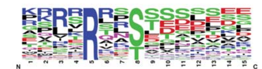
The motif logo shows the amino acid distributions around the sites recognized by Immunoaffinity beads from PTMScan® Phospho-Akt Substrate Motif Kit #5561 .