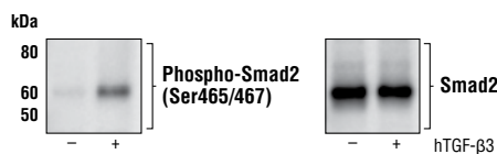
Figure 1. Treatment of HeLa cells with TGF- \beta 3 stimulates phosphorylation of Smad2 at Ser465/467, but does not affect the level of total Smad2 protein. The relationship between lysate protein concentration from untreated and TGF- \beta 3-treated HeLa cells and the absorbance at 450 nm using the FastScan™ Phospho-Smad2 (Ser465/467) ELISA Kit #86932 is shown in the upper figure. The corresponding western blots using phospho-Smad2 (Ser465/467) antibody (left panel) and Smad2 antibody (right panel) are shown in the lower figure. After serum starvation, HeLa cells were either left untreated or treated with 10 ng/ml hTGF- \beta 3 #8425 for 30 minutes at 37°C and then lysed.