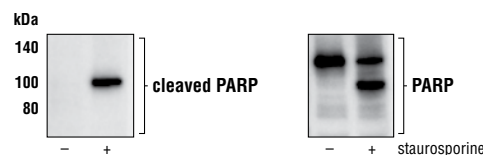
Figure 1. Treatment of HeLa cells with staurosporine induces cleavage of PARP at Asp214. The relationship between lysate protein concentration from untreated and staurosporine-treated HeLa cells and the absorbance at 450 nm as detected by FastScan™ Cleaved PARP (Asp214) ELISA Kit #67032 is shown in the upper figure. The corresponding western blots using a cleaved PARP specific antibody (left panel) and a PARP antibody which recognizes full length and cleaved PARP (right panel) are shown in the lower figure. HeLa cells were treated with 1 μM staurosporine for 3 hours at 37°C and then lysed.