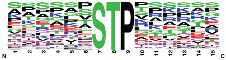
◀ The Motif Logo shows the amino acid distributions around the sites recognized by the antibody.

Applications Key: W—Western IP—Immunoprecipitation IHC—Immunohistochemistry ChIP—Chromatin Immunoprecipitation IF—Immunofluorescence F—Flow cytometry E-P—ELISA-Peptide Species Cross-Reactivity Key: H—human M—mouse R—rat Hm—hamster Mk—monkey Mi—mink C—chicken Dm—D. melanogaster X—Xenopus Z—zebrafish B—bovine Dg—dog Pg—pig Sc—S. cerevisiae Ce—C. elegans Hr—horse All—all species expected Species enclosed in parentheses are predicted to react based on 100% homology.