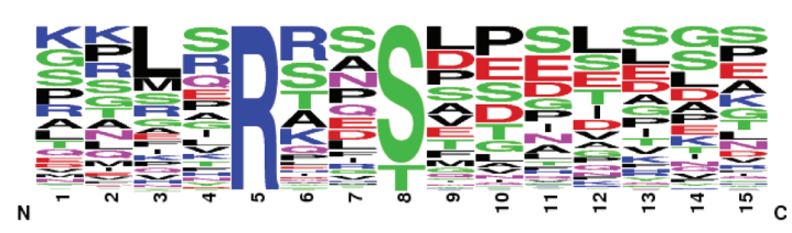
The Motif Logo shows the amino acid distributions around the sites recognized by the antibody.

Storage: Antibody beads supplied in IAP buffer containing 50% glycerol. Store at -20°C. Do not aliquot the antibody.