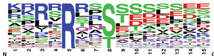
The Motif Logo shows the amino acid distributions around the sites recognized by the antibody.

Storage: Antibody beads supplied in IAP buffer containing 50% glycerol. Store at -20°C. Do not aliquot the antibody.