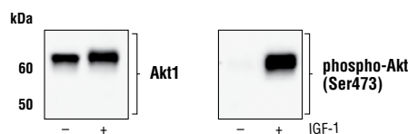
Figure 1. Treatment of MCF7 cells with IGF-1 stimulates phosphorylation of Akt1 at Ser473 but does not affect the level of total Akt1. The relationship between lysate protein concentration from untreated and IGF-1-treated MCF7 cells and the absorbance at 450 nm using the FastScan™ Phospho-Akt1 (Ser473) ELISA Kit #54336 is shown in the upper figure. The corresponding western blots using Akt1 antibody (left panel) and phospho-Akt (Ser473) antibody (right panel) are shown in the lower figure. After serum starvation, MCF7 cells were treated with 100 ng/ml IGF-1 #8917 for 5 minutes at 37°C and then lysed.