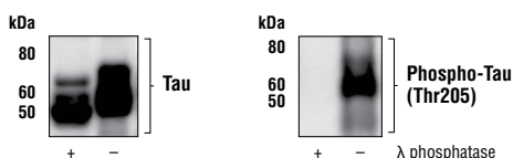
Figure 1. Tau is phosphorylated at Thr205 in untreated mouse brain extracts, but not in λ phosphatase-treated mouse brain extracts. The relationship between lysate protein concentration from untreated and λ phosphatase-treated mouse brain extracts and the absorbance at 450 nm using the FastScan™ Phospho-Tau (Thr205) ELISA Kit #51580 is shown in the upper figure. The corresponding western blots using Tau antibody (left panel) and phospho-Tau (Thr205) antibody (right panel) are shown in the lower figure. Mouse brain tissues were lysed and then either untreated or treated with λ phosphatase.