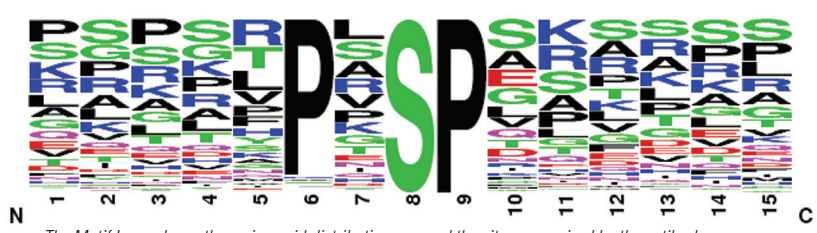
The Motif Logo shows the amino acid distributions around the sites recognized by the antibody.