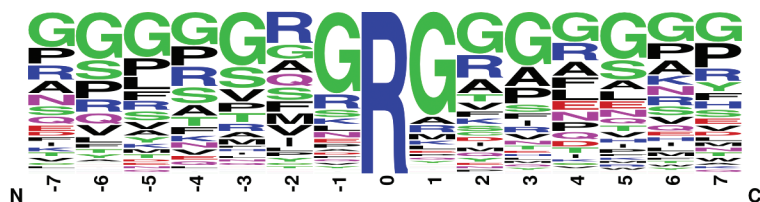
◀ The Motif Logo was generated from a MethylScan® LC-MS/MS experiment using 95 nonredundant tryptic peptides derived from mouse embryo immunoprecipitated with PTMScan® Symmetric Di-Methyl Arginine Motif [sdme-RG] Immunoaffinity Beads. The logo represents the relative frequency of amino acids in each position surrounding the central symmetrically di-methylated arginine residue. Glycine residues are enriched, especially at the +1 and -1 positions, in the context of symmetric di-methyl arginine when compared to the overall expected frequency in the mouse proteome.

License/Use Restrictions: Use of CST Motif Antibodies within certain methods (e.g., U.S. Patent No.'s 7,198,896 & 7,300,753) may require a license from CST. For information regarding academic licensing terms please have your technology transfer office contact CST Legal Department at CST_ip@cellsignal.com . For information regarding commercial licensing terms please contact CST Pharma Services Department at ptmscan@cellsignal.com .