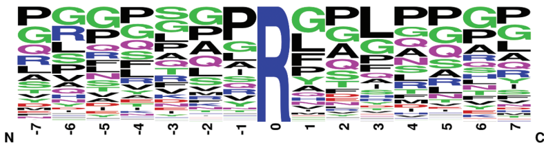
◀ This Motif Logo was generated from a MethylScan® LC-MS/MS experiment using 169 nonredundant tryptic peptides derived from mouse embryo and immunoprecipitated with PTMScan® Asymmetric Di-Methyl Arginine Motif [adme-R] Immunoaffinity Beads. The logo represents the relative frequency of amino acids in each position surrounding the central asymmetric di-methyl arginine.

License/Use Restrictions: Use of CST Motif Antibodies within certain methods (e.g., U.S. Patent No.'s 7,198,896 & 7,300,753) may require a license from CST. For information regarding academic licensing terms please have your technology transfer office contact CST Legal Department at CST_ip@cellsignal.com . For information regarding commercial licensing terms please contact CST Pharma Services Department at ptmscan@cellsignal.com .