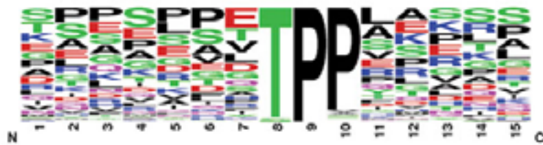
The Motif Logo shows the amino acid distributions around the sites recognized by the antibody.