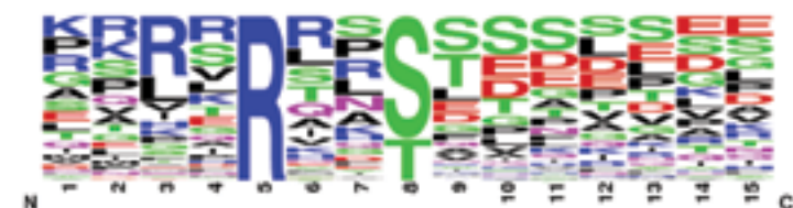
The Motif Logo shows the amino acid distributions around the sites recognized by the antibody.

Chart showing the proportions of underlying Akt substrate-like sequence motifs found in an Akt substrate PTMScan® study using Akt Substrate Motif mAb 1. Analysis of three cell lines gave 281 non-redundant peptide sequences containing Akt substrate-like motifs (Moritz et al., Akt-RSK-S6 kinase signaling networks activated by oncogenic receptor tyrosine kinases. Sci. Signal. 2010, 3, ra64). The proportion containing phosphoserine was 74%, and the proportion with arginine residues are both the -5 and -3 positions was 36%. Although this antibody has a preference for arginine residues at the -5 and -3 positions, it also recognizes peptides with an arginine residue at just the -3 position.